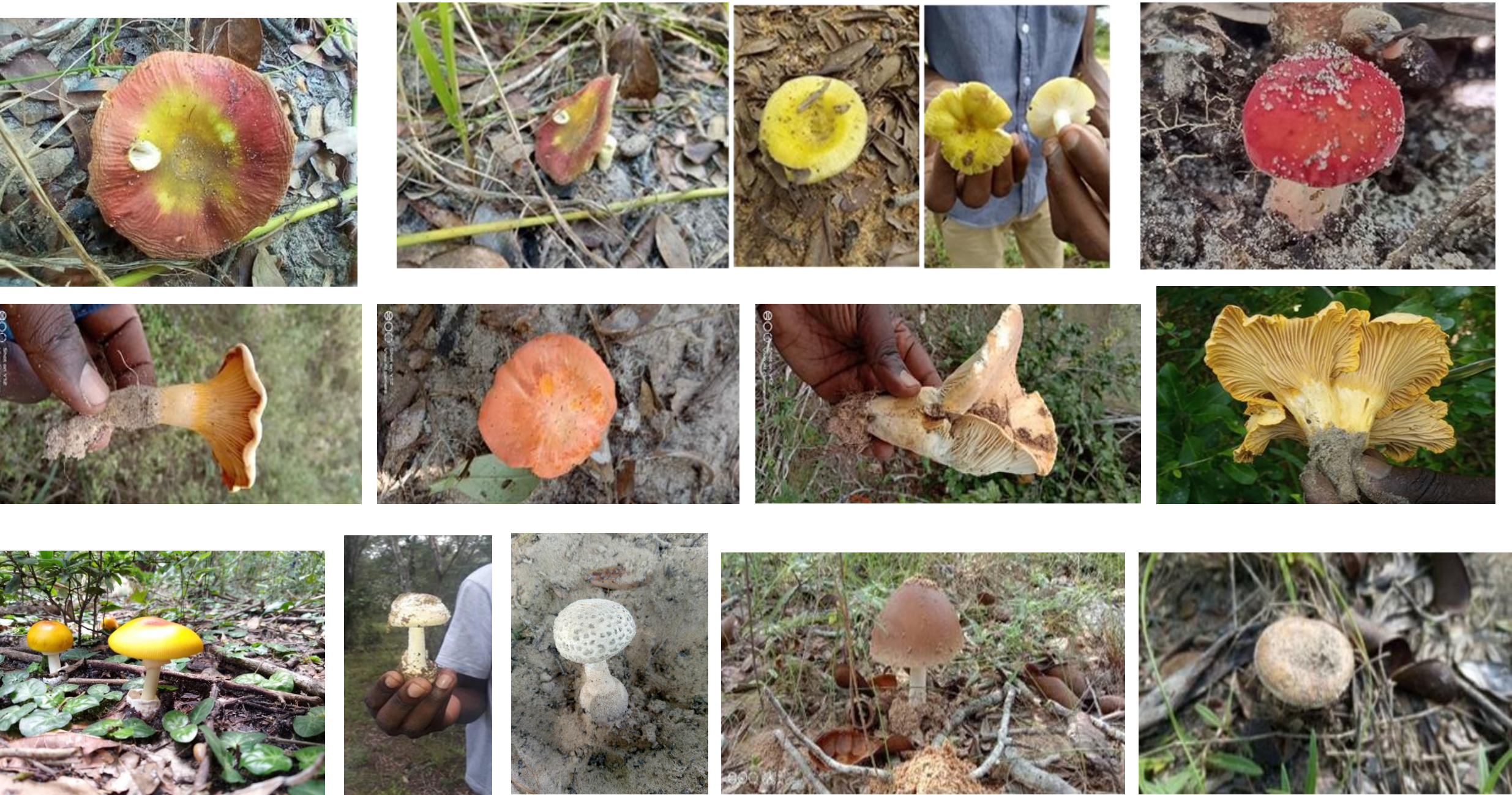
Russula spp., Canthrellus spp., Lactiflus sp.