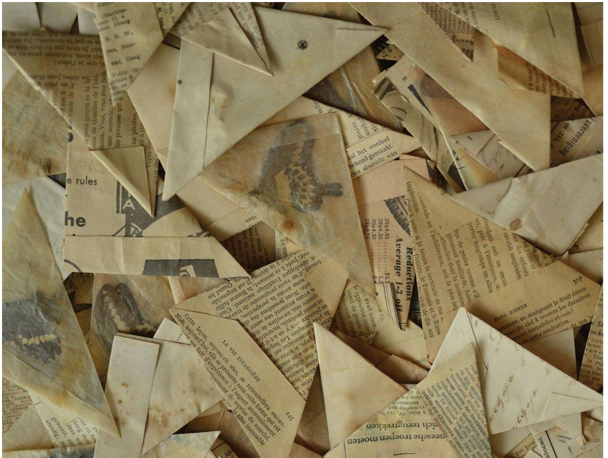
Caspers M, Willemse L, Miracle EG, van Nieukerken EJ (2019) Butterflies in bags: permanent storage of Lepidoptera in glassine envelopes. Nota Lepidopterologica 42(1): 1-16. <u>https://doi.org/10.3897/nl.42.28654</u>