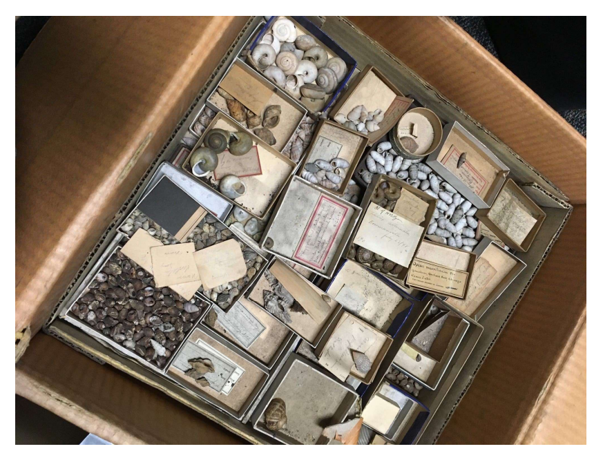
Chicago Academy of Sciences Malacology Collection