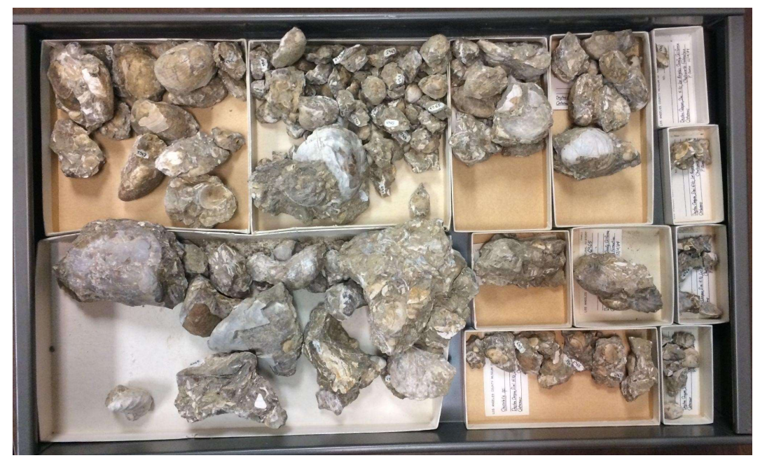
Natural History Museum of Los Angeles Invertebrate Paleontology Collection