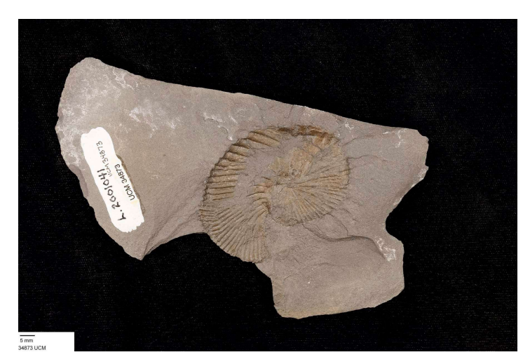
University of Colorado Museum of Natural History, Invertebrate Paleontology