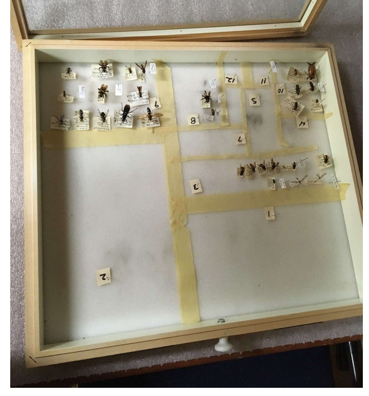
Chicago Academy of Sciences Entomology Collection