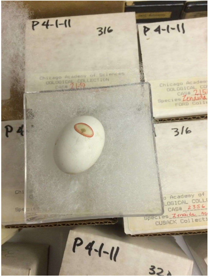
Chicago Academy of Sciences Oology Collection