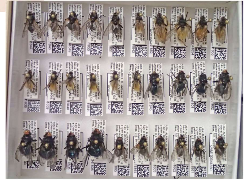
University of Alaska Museum (UAM) barcoded flies