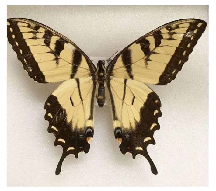
Chicago Academy of Sciences Entomology Collection